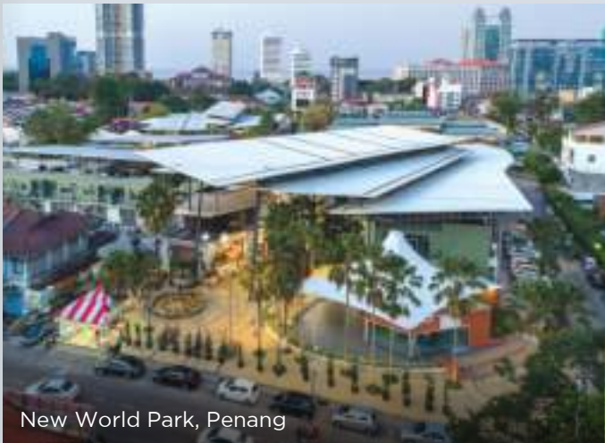
New World Park, Penang