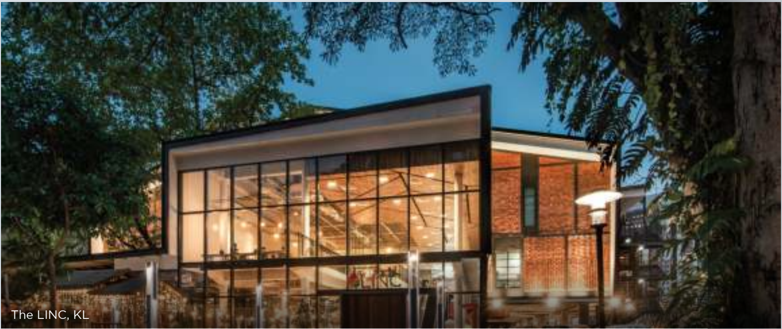
The LINC, KL