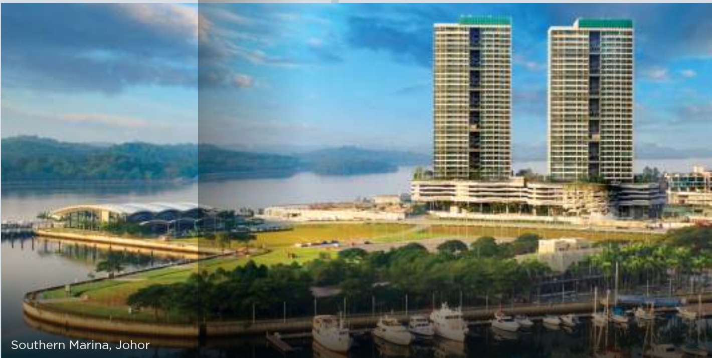
Southern Marina, Johor

The property division of PPB Group, PPB Properties has earned a sterling reputation from developing high-value, thoughtfully designed residential, retail and commercial properties over the years. PPB Properties develops, owns, and manages several malls and retails spaces in Kuala Lumpur and Penang.