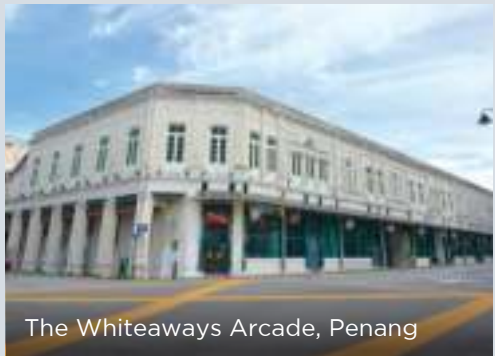
The Whiteaways Arcade, Penang

Developer: PPB Hartabina Sdn Bhd (12505-M), 7th Floor, Cheras Plaza, No. 11, Jalan Manis 1, Taman Segar, Cheras, 56100, Kuala Lumpur • Tel: 03-91305088 • Fax: 03-91307088 • Project Name: Megah Rise • Developer's License No.: 1079-6/11-2021/03342(L) • Validity: 10/11/2020 - 09/11/2021 • Advertising & Sales Permit No.: 1079-6/11-2021/03342(P) • Validity: 10/11/2020 - 09/11/2021 • Land Tenure: Freehold • Land Encumbrances: Nil • Restriction in Interest: Nil • Approving Authority: Majlis Bandaraya Petaling Jaya • Approved Building Plan No.: MBPJ/120100/T/P10/454/2017 • Expected Completion Date: February 2022 • Development Type: Serviced Apartments • Total Units: 228 units • Sizes: 764sf - 3,232sf • Price: RM894,800(Min.) - RM5,236,800(Max.) • Bumiputera Discount: 7%