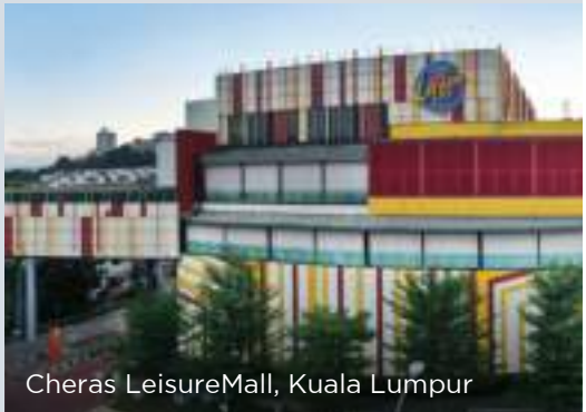
Cheras LeisureMall, Kuala Lumpur